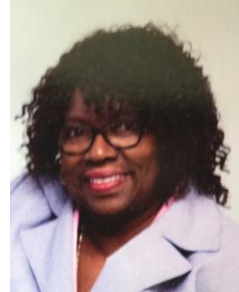
"Wife, Mother, Grandmother, Teacher and Cancer Survivor"